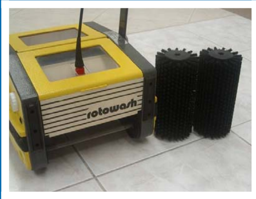
Drying the Brushes