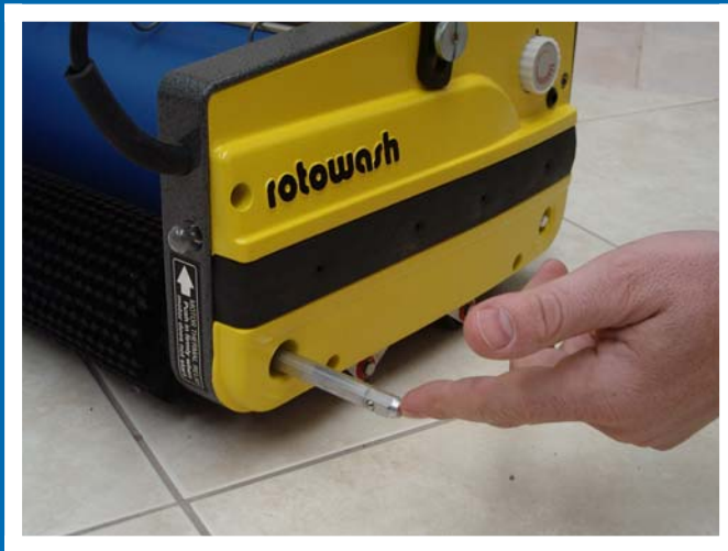
Push out the Axle