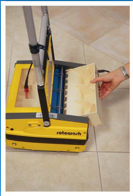
Waste Water Tray

If protective gloves are not already worn, they should be during cleaning of the machine.