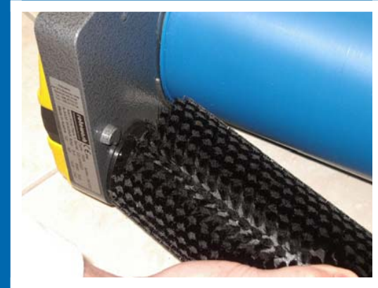
Replacing the Brushes

All machines have brush locators to make the brushes easier to install. Brushes will fit back or front and once seated in the brush locators the axle rod should be inserted into the hole in the side casting under the black rubber bumper. As the axle rod and hole are both hexagon shaped they need to be lined up to ensure smooth running through the center core of the brush. When the axle rod reaches the far side it must again align the hexagon shape to fit into both side castings. There is no need to force the axle rod, if it does not “click” instantly, simply turn the brush gently as you push the axle rod into the hole.