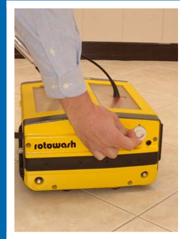
Height Control Knob

Adjust the brush height so that the brush is sweeping the pile