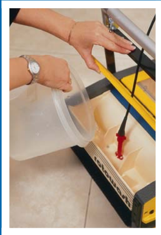
Clean Water Tray

Prepare the surface by removing large waste particles i.e. paperclips, waste paper etc. Add water to the clean water tray or tank with deodorant if required