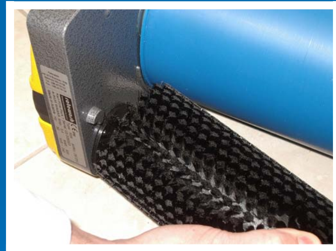
Remove the Brush

and only a few minutes are needed, at the end of a cleaning operation, to prepare the machine for the next job.